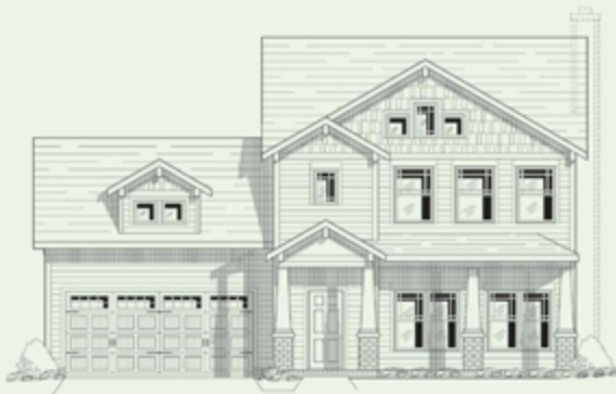
Front Elevation A