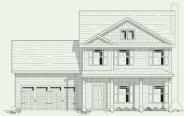
Front Elevation B

Prices, features and square footages are subject to change without notice. Renderings may vary in precise detail from actual construction, all dimensions are approximate.